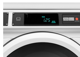
ONE-TOUCH CYCLE SELECTION