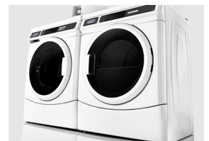
MATCHING WASHER AVAILABLE