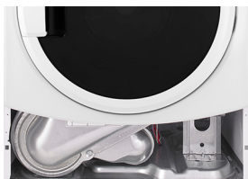
FRONT ACCESS PANEL